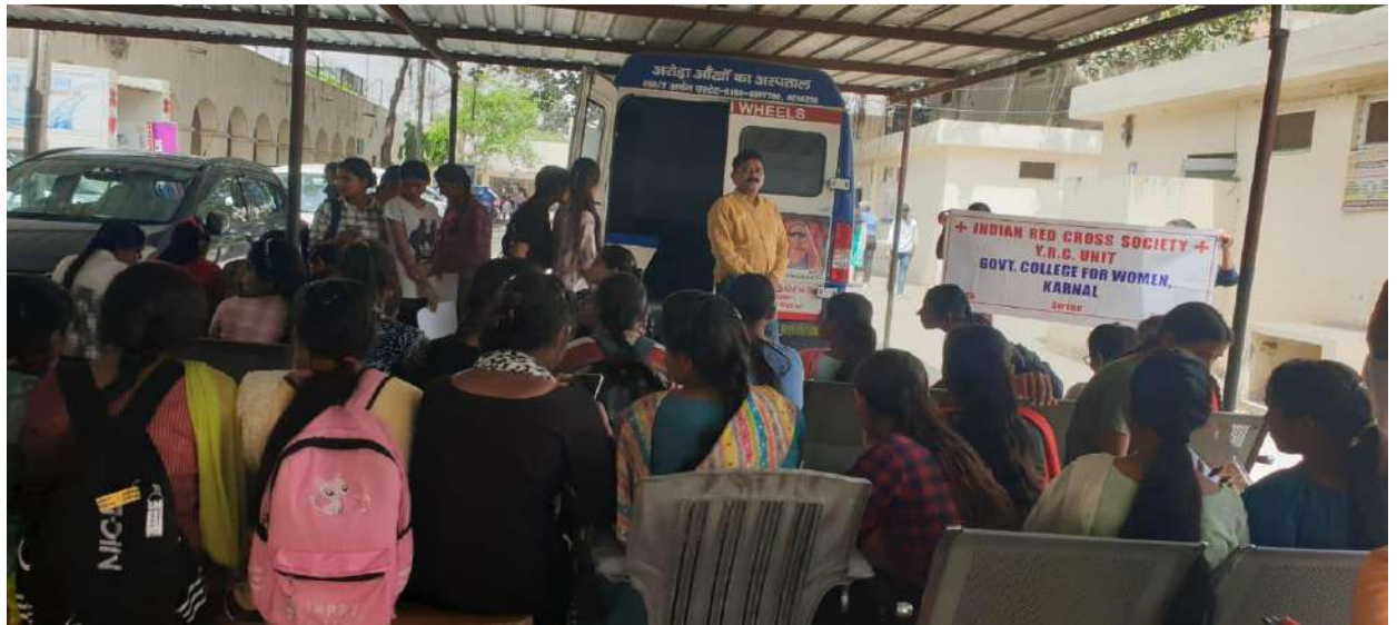
Figure 10.1 FREE EYE CHECK UP CAMP ON 19.4.24

A Free Eye Check Up Camp was organized by Red Cross Committee on 19.4.24 in which screening of 129 students was done.