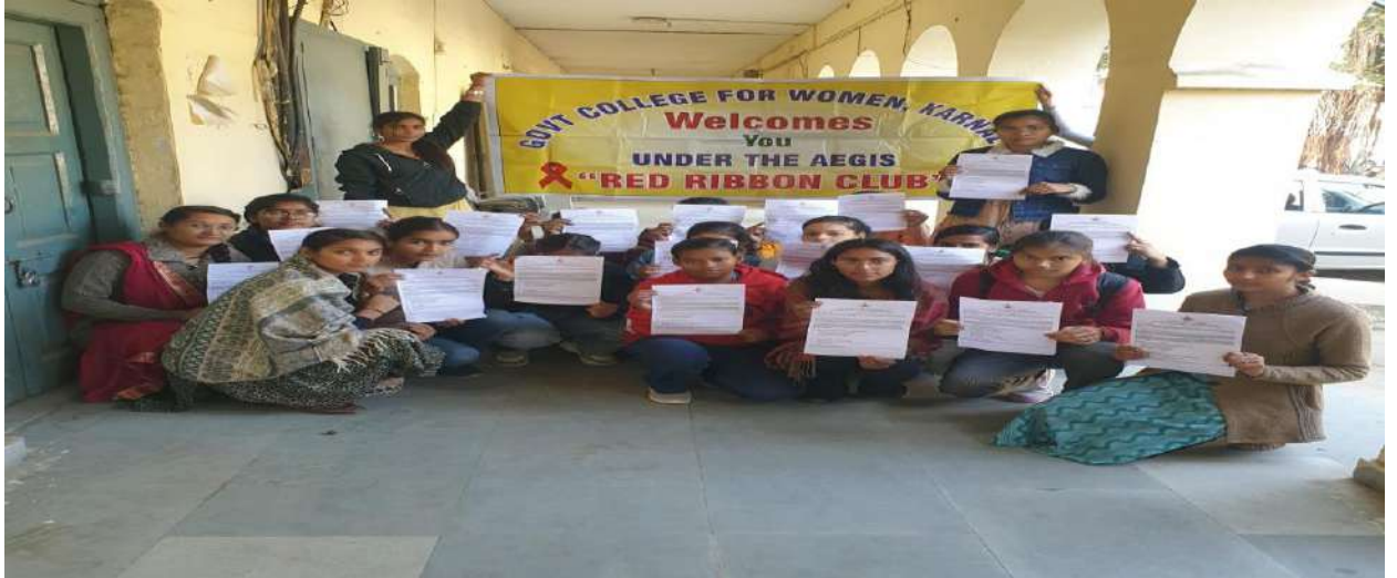
Figure 4.1 Distribution of pamphlets among students