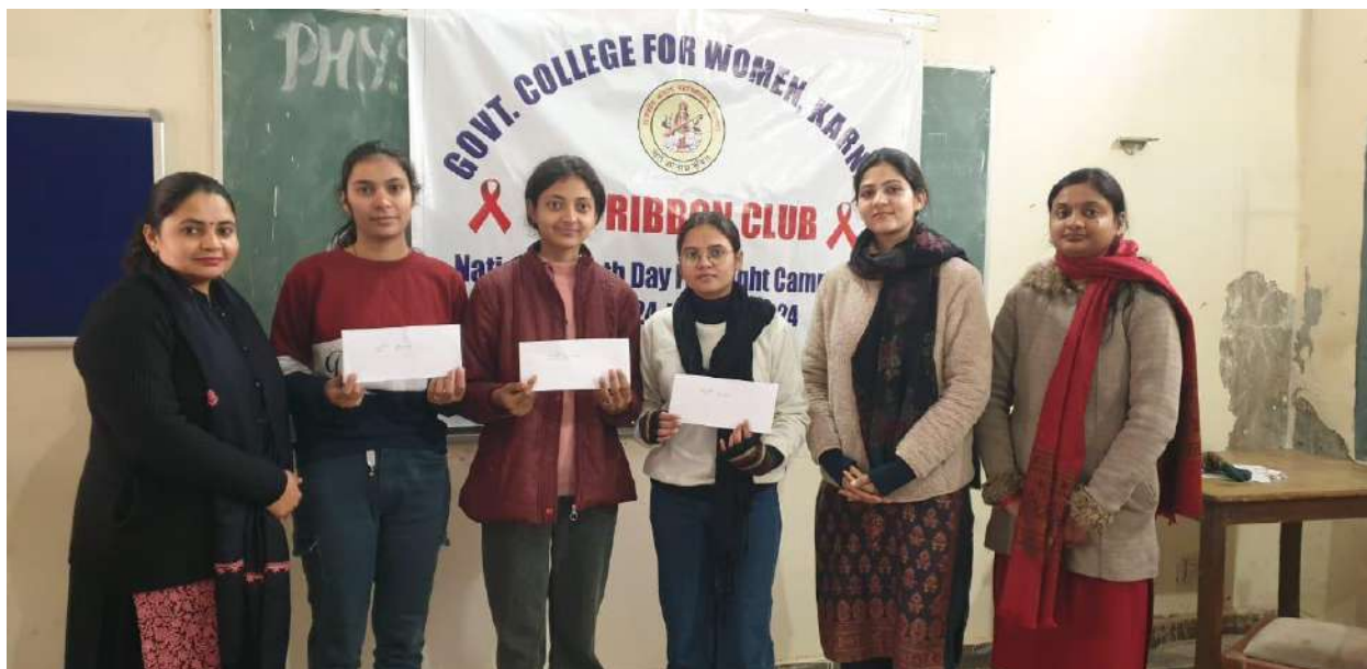
Result for Essay Writing competition on 25.1.24