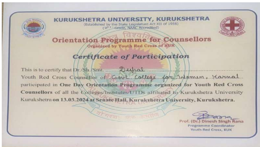
Figure 7 TRAINING FOR YRC COUNSELLORS

9. Ms. Deepal (Maths) attended one day orientation programme for Youth Red Cross counsellors on 13.3.24 at KUK.