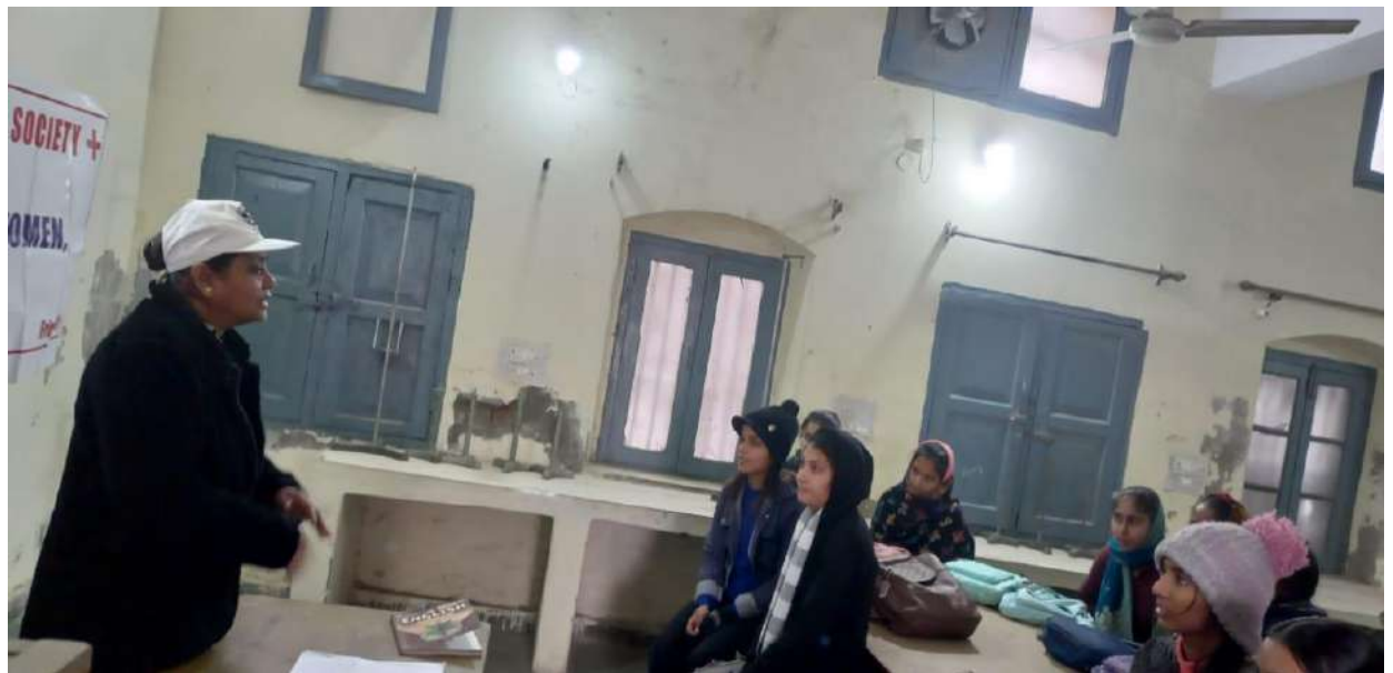
Figure 7.2 LIFE SKILL DEVELOPMENT WORKSHOP ON 18.1.24