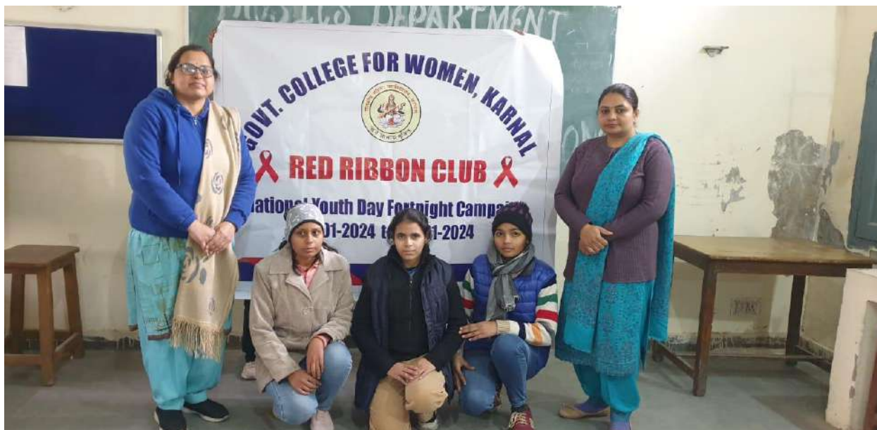
Result for Nail Act competition on 24.1.24