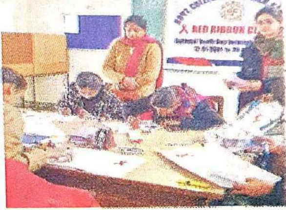
प्रतियोगिता में भाग लेती छात्राएं।