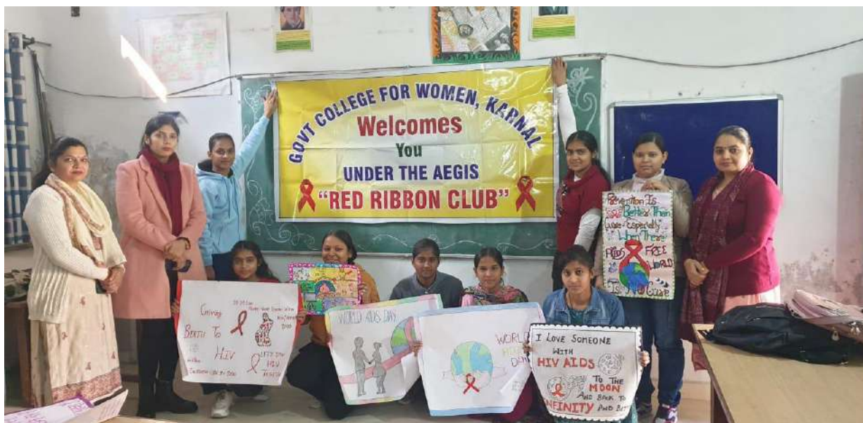
Figure 5 poster making competition on 20.12.23