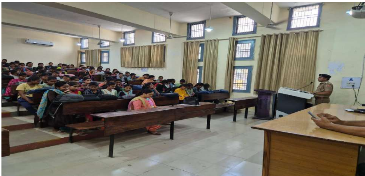
Figure 11.2 CYBERCRIME AWARENESS PROGRAM ON 20.4.24