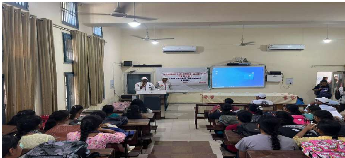
Figure 1 CPR TRAINING 8.9.23

CPR Training through documentary and live demonstration to protect the lives of victims held at GCW, Karnal on 8.9.2023 . A team from Red Cross, Karnal provides the training and distributes the pamphlets among students. 120 students attended the training.