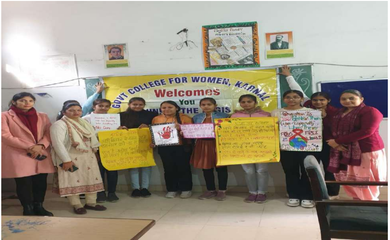
Figure 5 Slogan writing Competition on 20.12.23