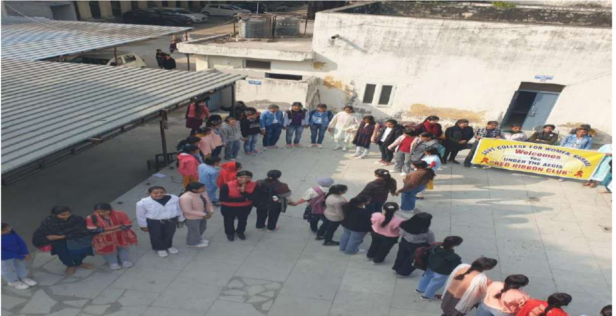
Figure 3 RED RIBBON HUMAN CHAIN ON 15.12.23