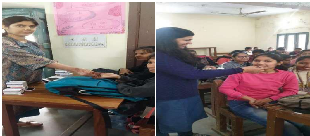
Figure 8.1 DE WORMING DAY ON 15.2.24

Red Cross Committee has celebrated National De-worming on 15.2.24 and Mop-up day on 20.2.24 by distributing Albendazole among 1700 students of college.