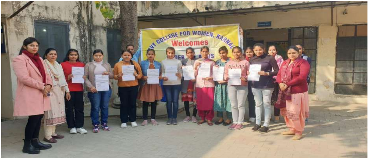
Figure 4.2 Distribution of pamphlets among students