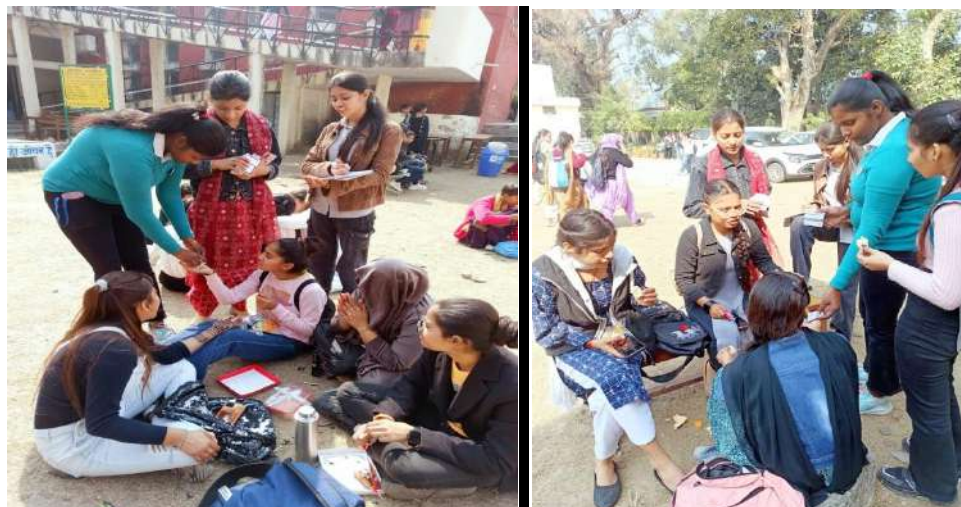
Figure 8.2 MOP UP DAY ON 20.2.24

9. Ms. Deepal (Maths) attended one day orientation programme for Youth Red Cross counsellors on 13.3.24 at KUK.