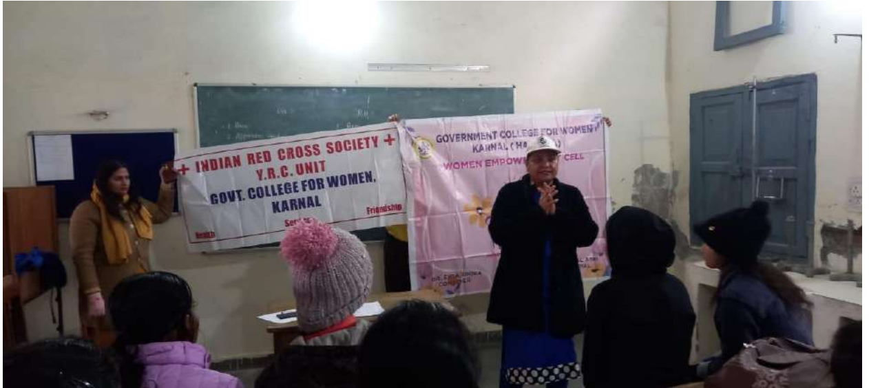
Figure 6.1 LIFE SKILL DEVELOPMENT WORKSHOP ON 18.1.24