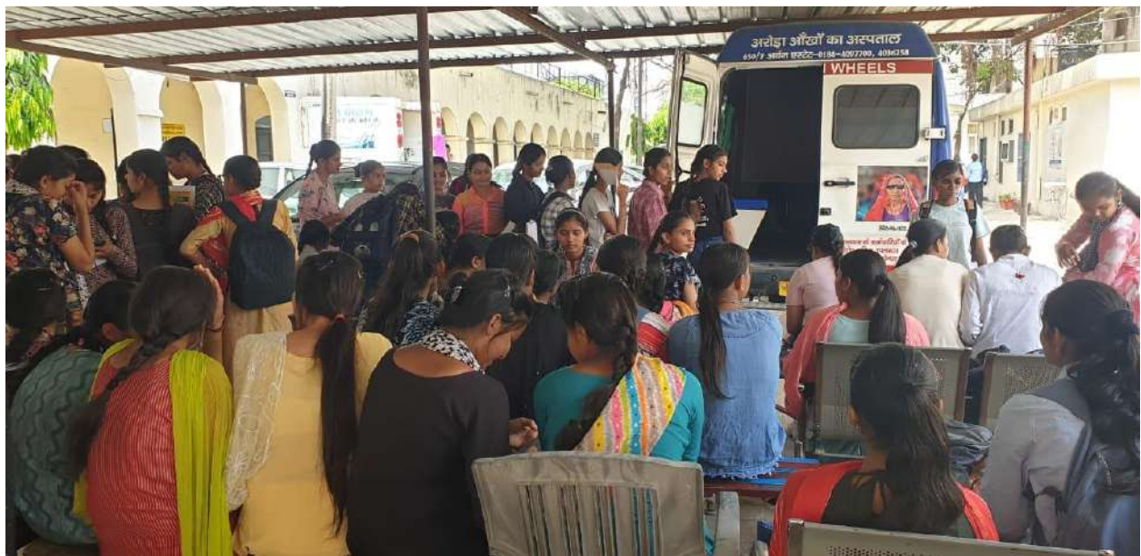
Figure 10.2 FREE EYE CHECK UP CAMP ON 19.4.24