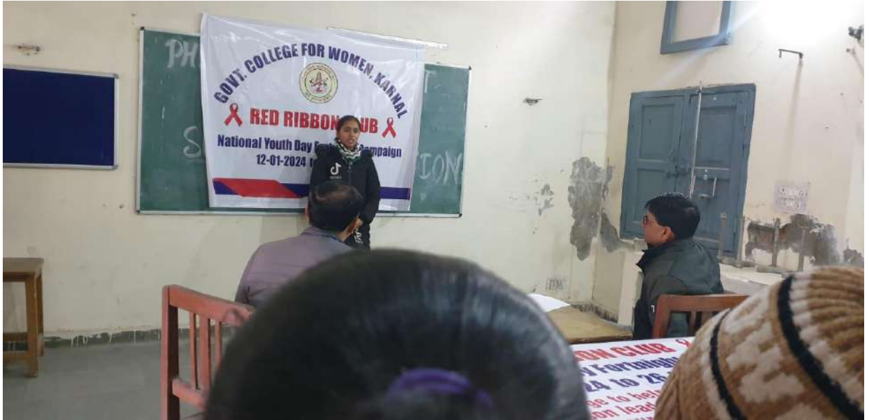
Result for Declamation competition on 23.1.24